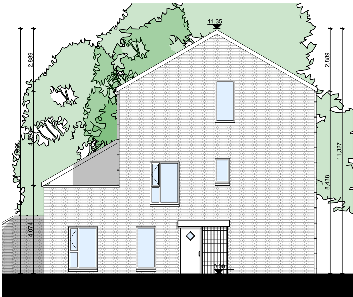
W6 North Elevation SCALE 1:100