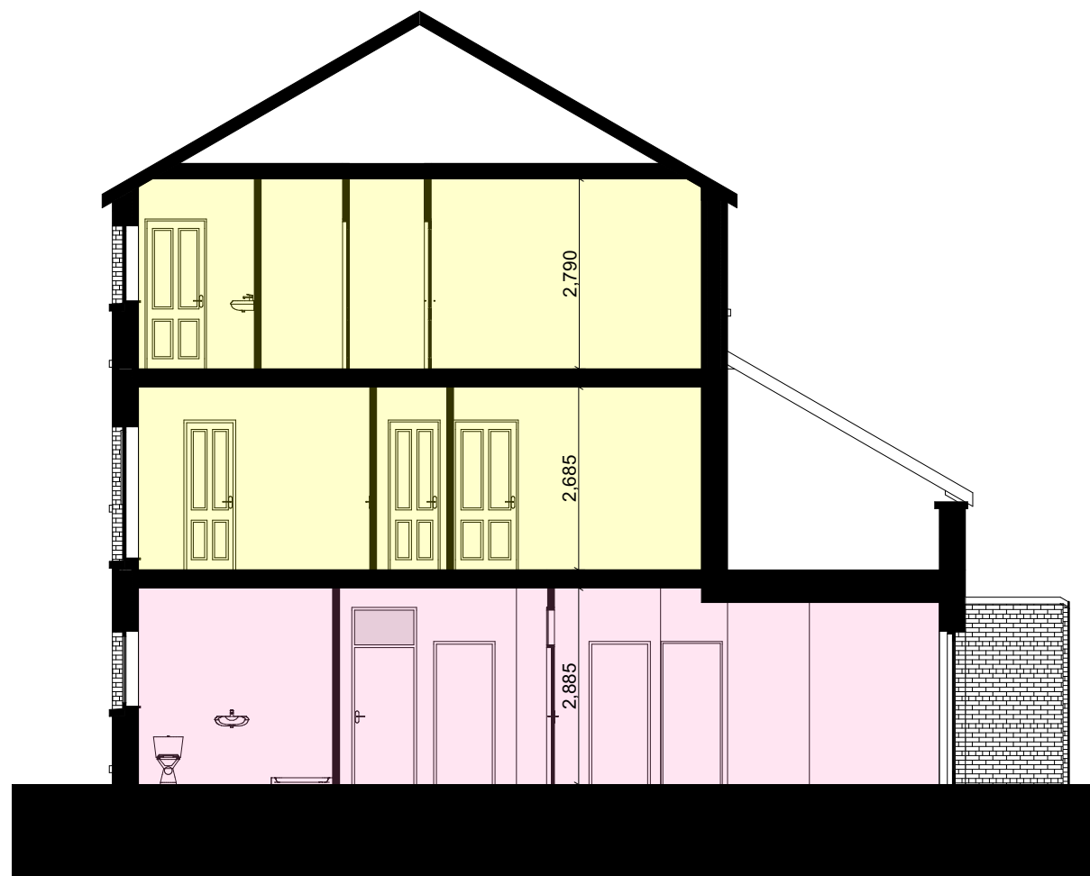
B Section BB SCALE 1:100