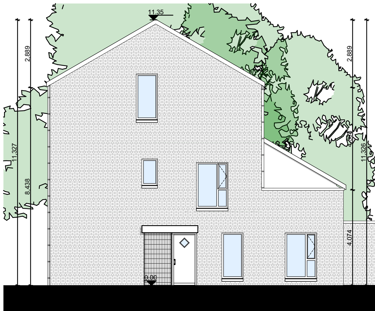
W7 South Elevation SCALE 1:100