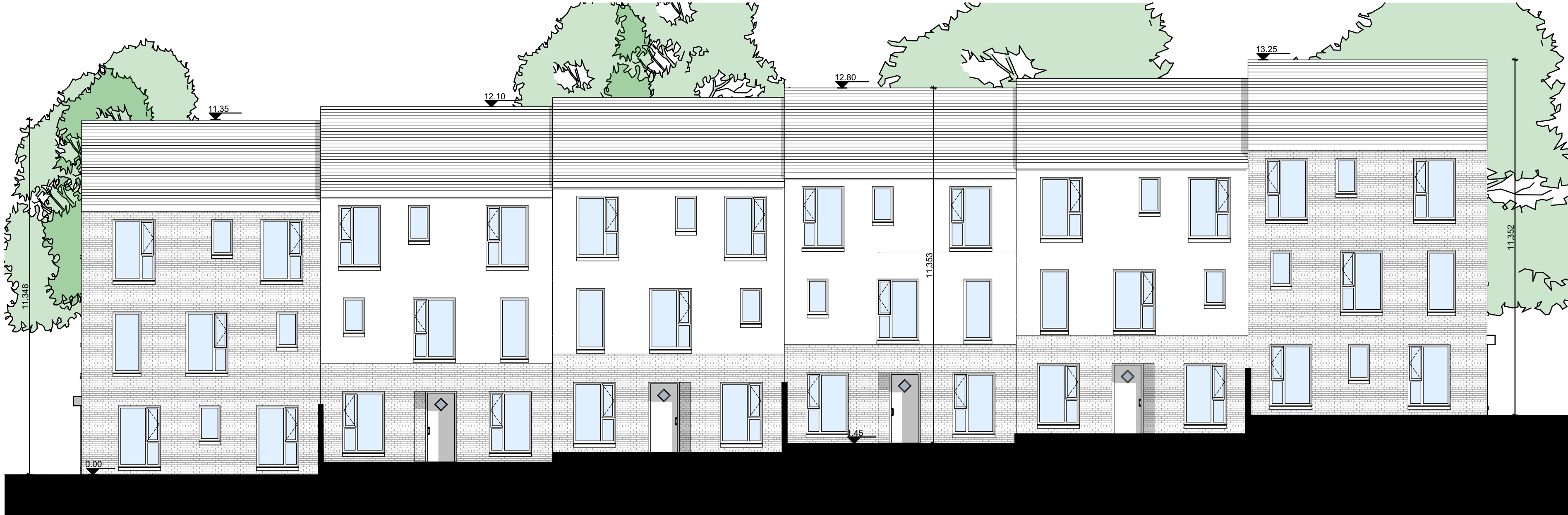
W4 West Elevation SCALE 1:100