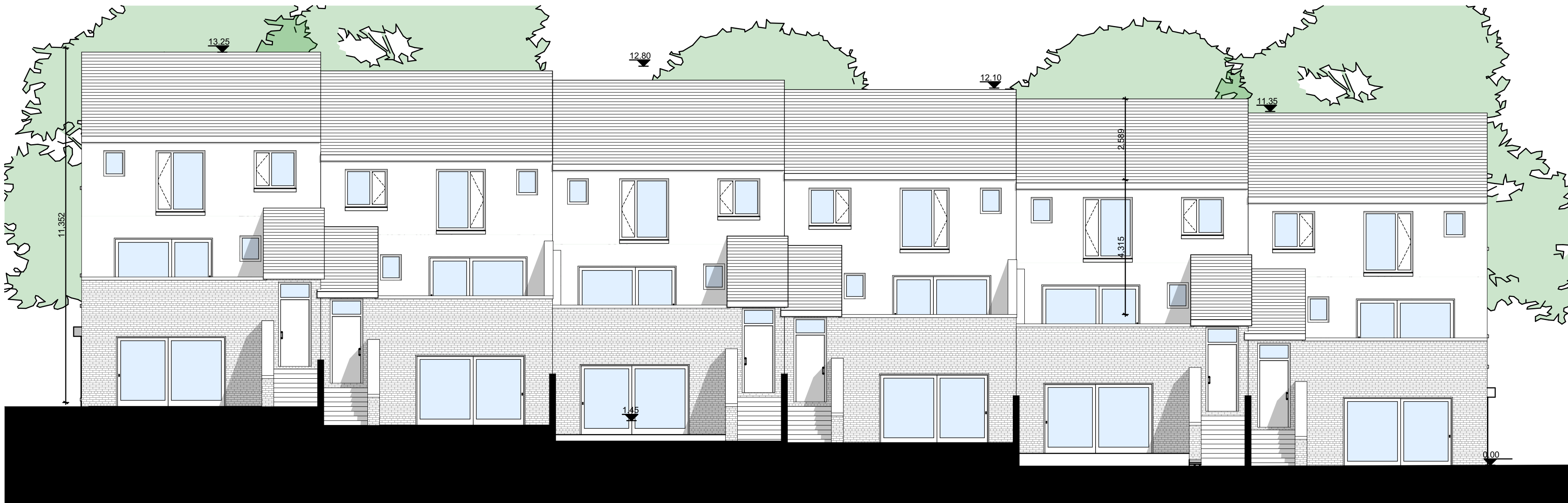
W5 East Elevation SCALE 1:100